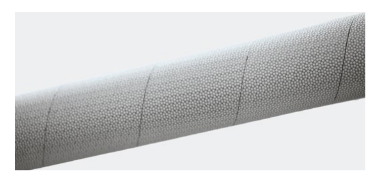
Complete roller spiral wrapped, providing grip and a nonstick surface.