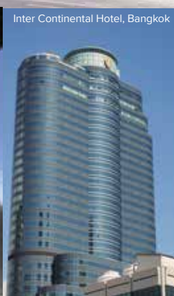
Inter Continental Hotel, Bangkok