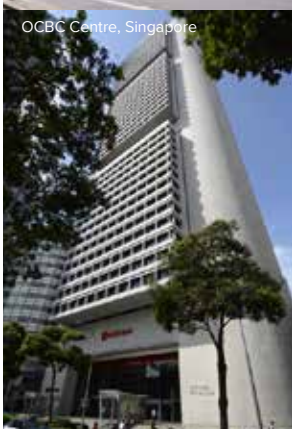
OCBC Centre, Singapore