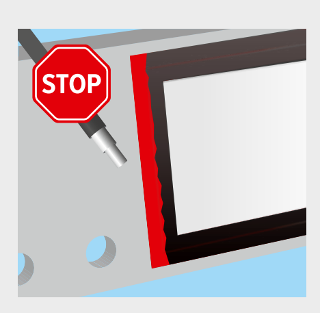
1. Apply first a red and then above a black-colored tape