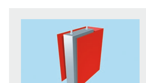
Applications for Cells We provide tape solutions for highly automated processes and reliable production.