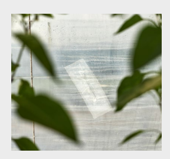
Results: Healthy plant growth all year round

Product available in 50 mm, 75 mm, 100 mm and 150 mm width; 33 m length. Please contact us for further information.