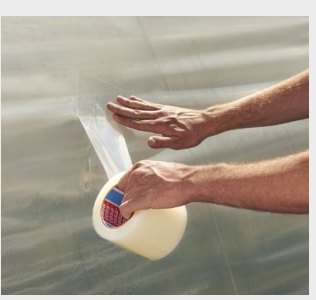
Step 1: Check film regularly Step 2: Apply tesa® 4646 on a dry and clean surface