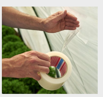
Step 3: Repeat on the inner layer