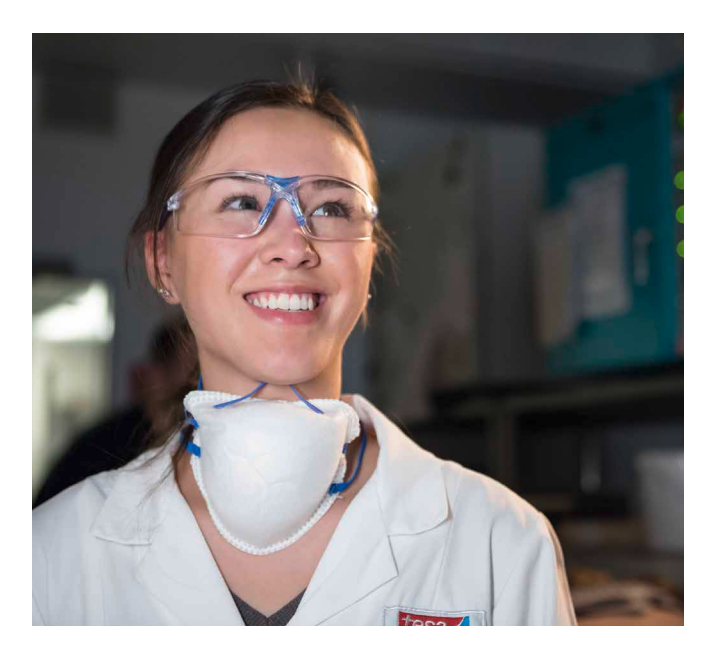
Safety goggles are an essential part of personal protective equipment in all tesa laboratories.

> In 2018, the Concagno plant was certified according to ISO 45001 for the first time.