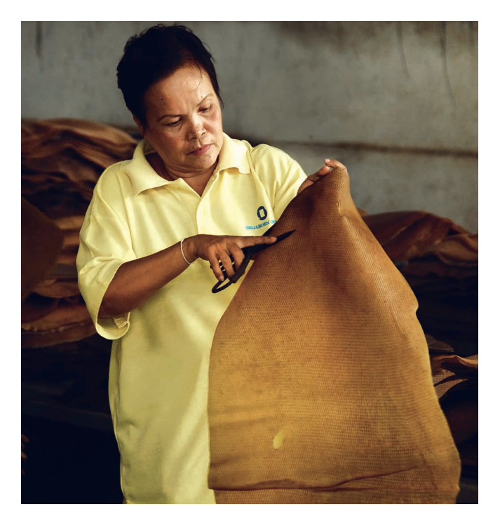
Rubber is one of the most important raw materials in adhesive manufacturing.

The CoCfS establishes the foundation for the responsible management of our global procurement processes and is mandatory for all main suppliers that supply tesa directly. It describes fundamental rules and obligations in the area of human rights, labor standards, environmental protection and corruption prevention. The ten principles