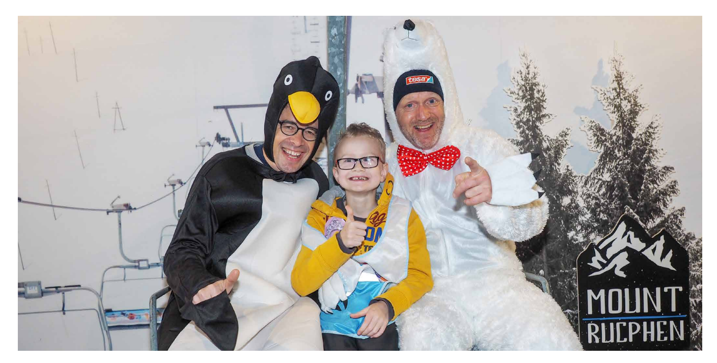
"tesa helps": tesa employees from the Netherlands helped children with physical and mental disabilities enjoy a very special day at the Rucphen indoor winter sports center Skidôme.

prove the elementary school education of the children of migrant workers. A total of about 700 children have already received a scholarship ("tesa Sunshine Scholarship"). In India, tesa supports the "Nanhi Kali" organization, which enables disadvantaged young girls to obtain an elementary school education.