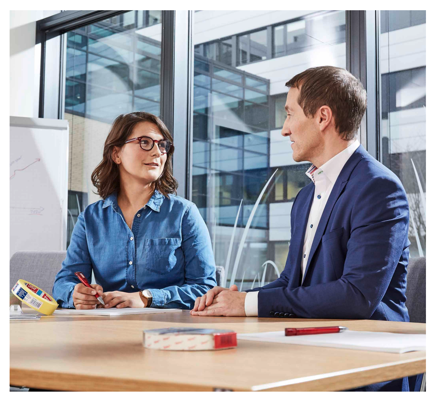
Strategic personnel development plays an important role at tesa in preparing up-and-coming talent for key positions on an international level.

lasting up to six days as part of a globally uniform leadership training scheme. With a total of four training cycles, the Essential Leadership Program was also rolled out very successfully in Germany. The international introduction of this portion of the Leadership Program has therefore now been completed. Wherever necessary, this training will be augmented in some regions with short leadership tool training units.