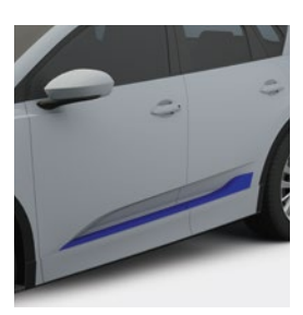
Door edge molding