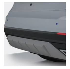
Park distance sensor