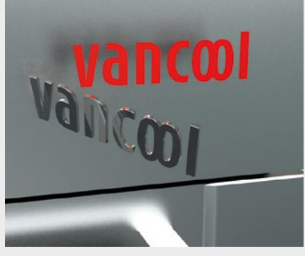
Mounting of emblems