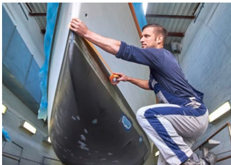
Excellent handling and UV resistance

With these characteristics, the tesa® Precision Mask 4342 is suitable for a broad range of different application conditions and gives you more flexibility in planning and executing outstanding paint jobs. Just give us a call and try it for yourself.