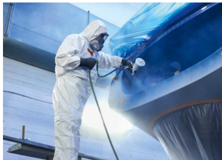
Excellent adherence of paints and fillers