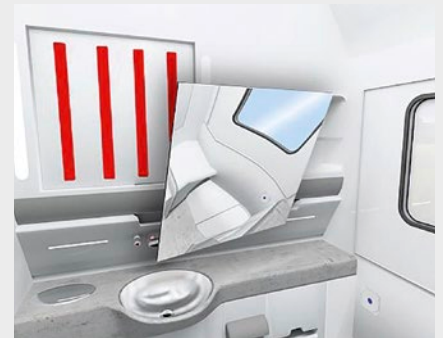
Mounting Panels and Decorative Elements in the Recreational Vehicle Industry