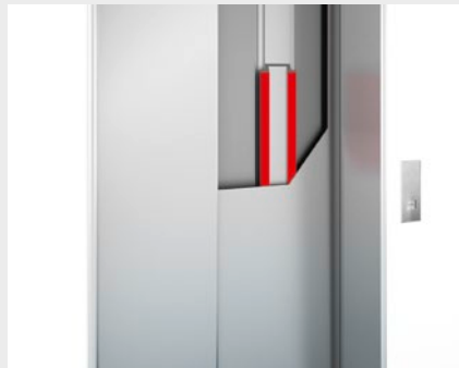
Mounting of Reinforcement Bars for Elevators