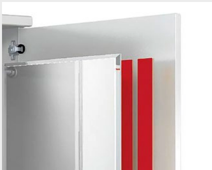
Mounting of Mirrors in the Furniture Industry

tesa® 62935 is our new 1,000 µm PE foam tape with an improved PE foam quality. It is part of the tesa® High Bond Tapes (629xx series) that are suitable for a wide range of demanding bonding applications, both indoor and outdoor. Compared to our leading mirror-mounting tape tesa® 4952, we were able to increase peel adhesion with this new-generation tape by more than 100%, ensuring a secure and long-lasting bond.