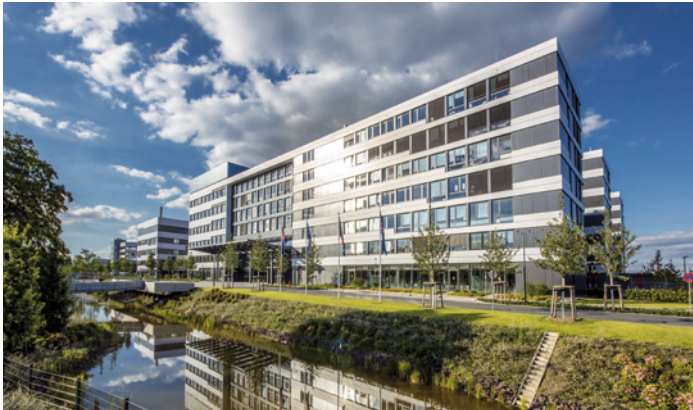
Image Overview – Building and Executive Board