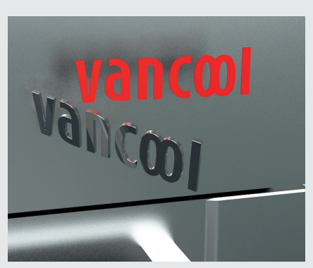
Mounting of emblems