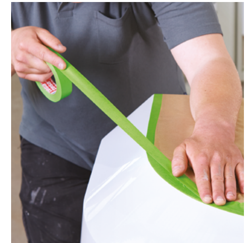
Great initial tack