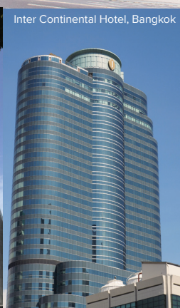
Inter Continental Hotel, Bangkok