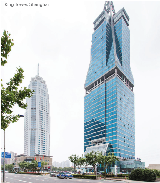
King Tower, Shanghai