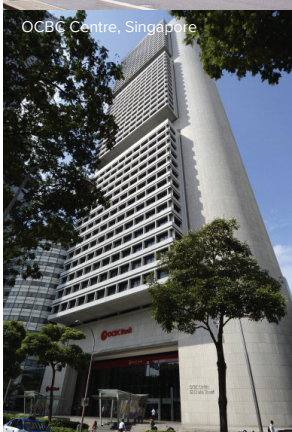
OCBC Centre, Singapore