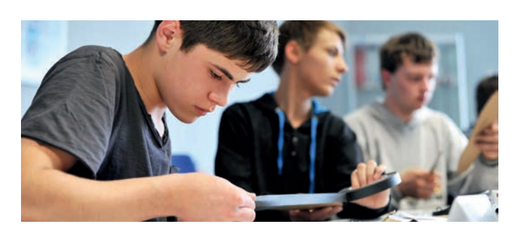
Fostering Creativity Multifaceted commitment

"Das macht Schule" and the Hamburg-based initiative Mentor e.V. are involved in fostering children's creativity. >> Page 20