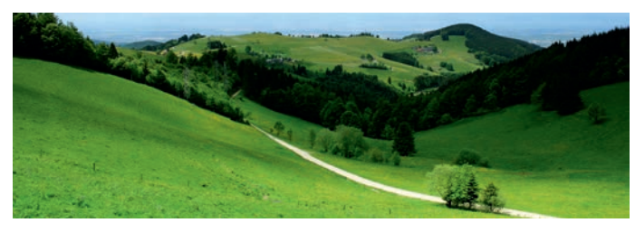
Declaration of Support

provement process. With more than 50 affiliates worldwide, there are a large number of projects involved. For that reason, this report is limited to a representative selection of current initiatives. We began publishing our Progress Report in an online version in 2008. In addition to the advantage of better accessibility, an online report also offers opportunities for regular updates. You can also visit the "Responsibility" section of our website for comprehensive information on the topics of the environment, employees, products, and social matters: www.tesa.com/company/responsibility.