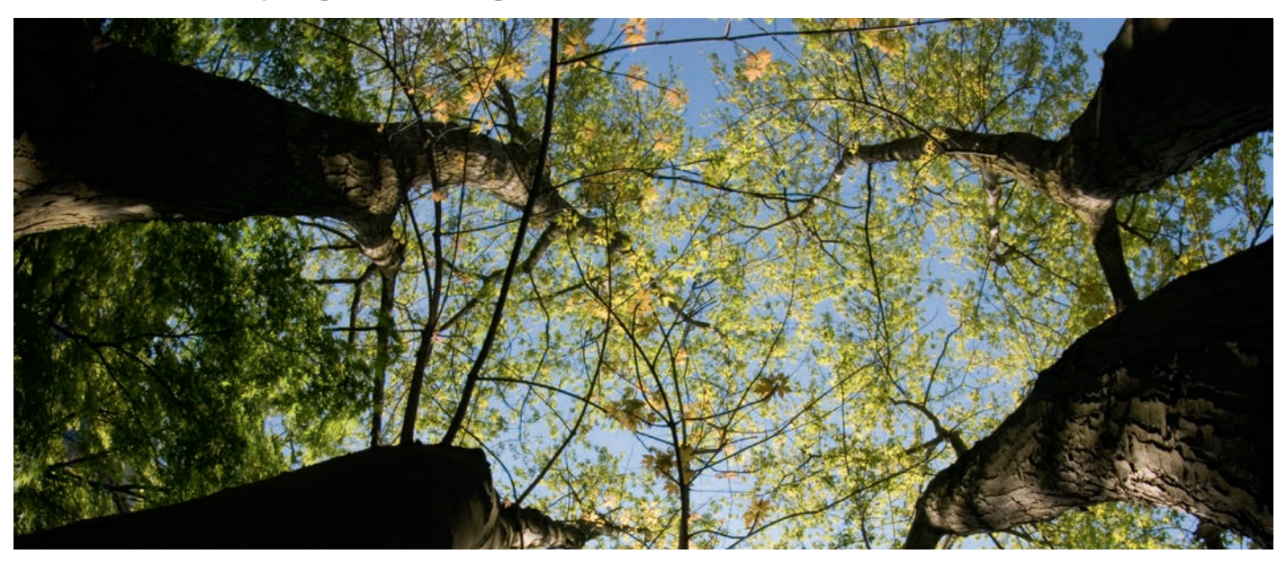
Mandatory targets are the key to our successful environmental management approach. All tesa locations have very high standards.