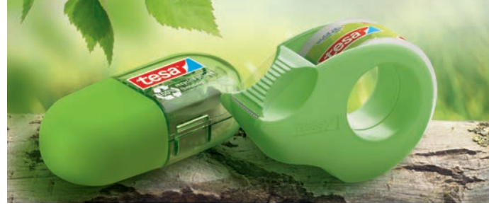
Eco-friendly products Consumers benefit from tesa

tesa operates climate protection measures on its own initiative and responsibility in order to leave an intact environment for subsequent generations. >> Page 14