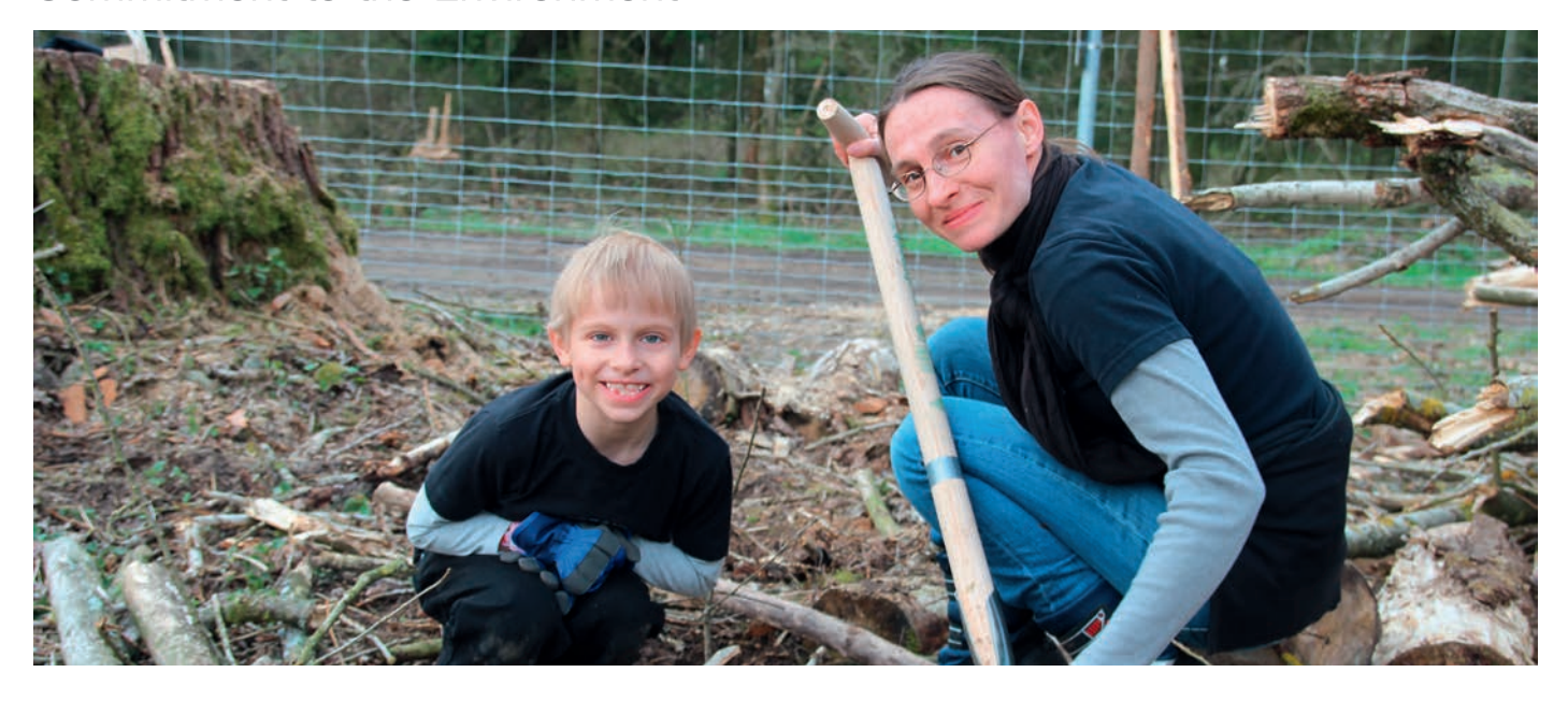
We are in partnership with the UNESCO Lower Saxonian Elbe River Biosphere Reserve and ensure targeted reforestation.

To mark the 75th anniversary of the tesa brand in 2011, we entered into an active partnership with the Lower Saxonian Elbe River Biosphere Reserve and are supporting a restoration project to establish new populations of deciduous trees. The commitment includes the donation of 75,000 young oaks and corporate volunteering activities. Following the first planting campaigns in the prior reporting year, tesa employees took up their spades once again in 2012, some of them with their families. Together they placed over 2,500 new young plants in the earth. Maintenance and some replanting were also carried out. The development of new forest populations helps to lessen the greenhouse effect and has a positive effect on biodiversity. The Lower Saxonian Elbe River Biosphere Reserve measures 570 square kilo-