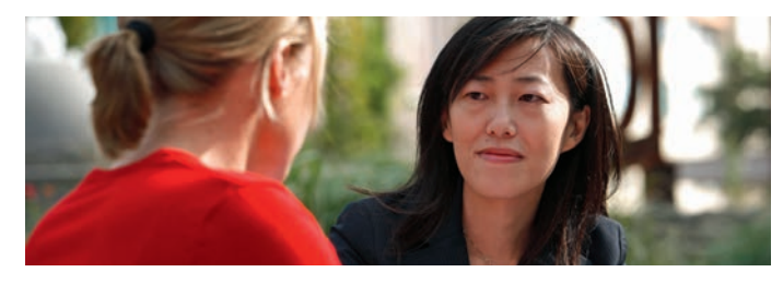
Human Rights and Labor Standards

The human factor as a determinant of success Numerous activities in the areas of employee qualifications as well as occupational health and safety characterized the