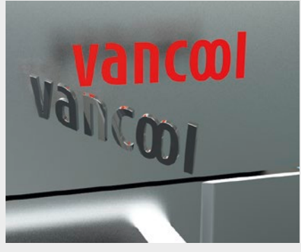
Mounting of emblems