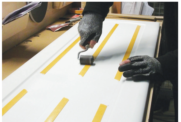
Pressure being applied