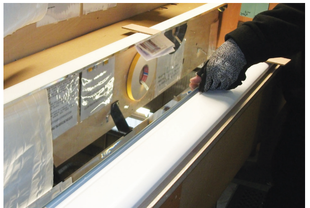
Mirror being located