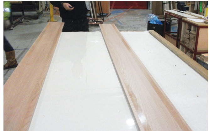
tesa® 4965 applied to door panels