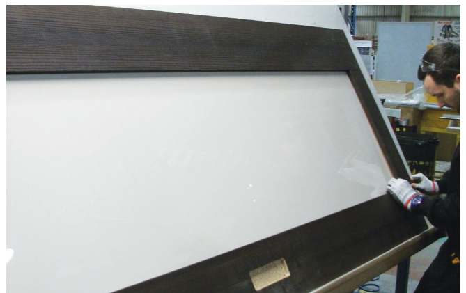
Door panels being located

tesa UK Ltd, Yeomans Drive, Blakelands, Milton Keynes, MK14 5LS Tel: 01908 211333 Email: ukenquiry@tesa.com