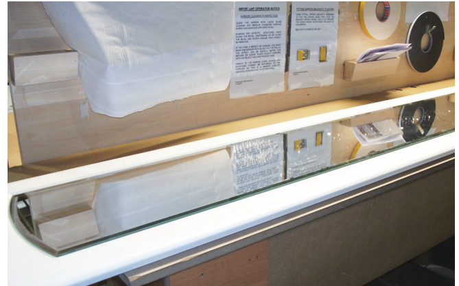
Mirror bond has been completed

tesa's Mat Lord summarises – "Following the detailed series of laboratory tests that we conducted, Hammonds now has renewed confidence in a 'tape-only' method and tesa® 4952 is approved for all mirror & deco glass mounting applications. They have a solution with proven and tangible results and we have also helped with the lamination process that has been adopted in the factory."