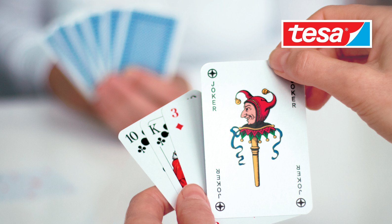
PLATE MOUNTING TAPES FOR INCREASED EFFICIENCY