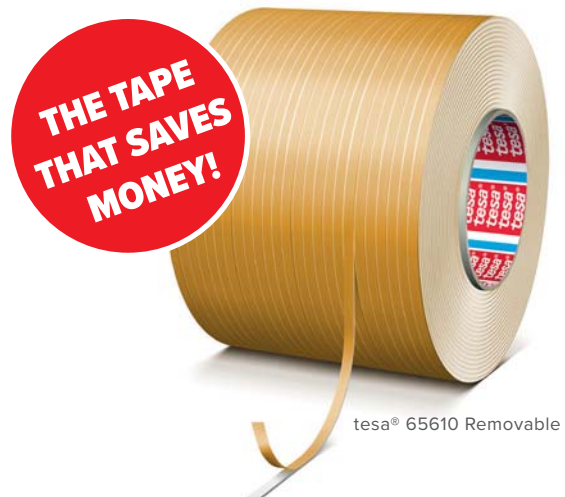
tesa® 65610 Removable