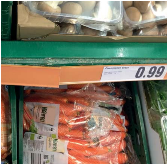
Real situation with conventional foam tape