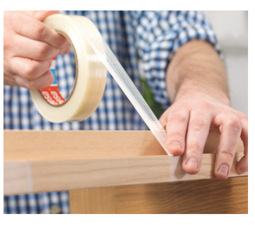
tesa® 4591 for bundling applications