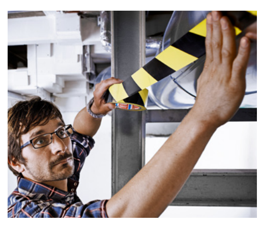
tesa® 4169 marking hazardous area