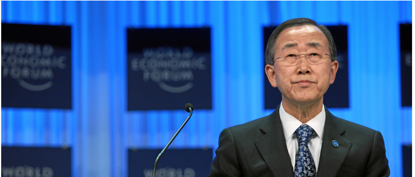
Ban Ki-moon, Secretary-General of the United Nations (World Economic Forum)