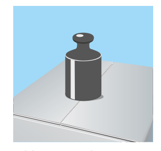
< 20 kg single flute for normal light weights

Corrugated Quality – the Differences Different weights require different boxes made of different kinds of cardboard. Certainly lightweight and mid to heavy goods are better protected in a double flute or triple flute box, but hazardous goods should be packed in triple flute boxes, (Note: Certain provisions are mandated by regional law!) The following illustrations show the difference between the corrugated qualities: