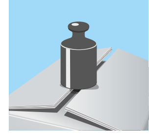
< 40 kg double flute for mid to heavy loads