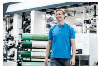
Print & packaging solutions