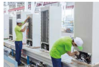
Home appliances & general industries

tesa SE Corporate Communications Hugo-Kirchberg-Straße 1 22848 Norderstedt +49 40 888 99 0 pr@tesa.com